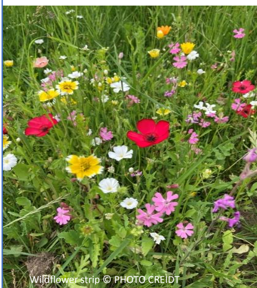
Wildflower strip