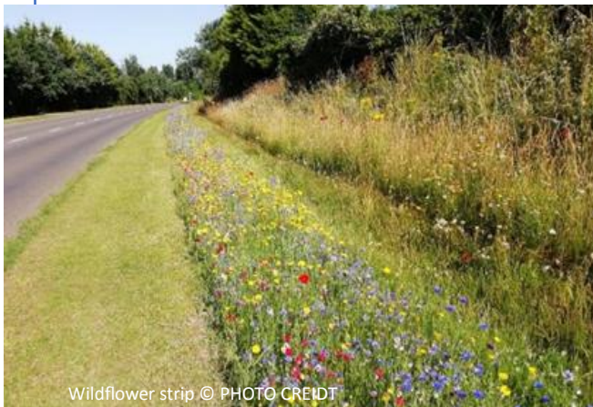
Wildflower strip

The A19 provides the main access route into Hunstanton. This wildflower strip is a wonderful example of how habitat fragmentation can be tackled by connecting and extending national B-Lines. It also provides an attractive welcome to visitors, showcasing Norfolk's wild beauty.